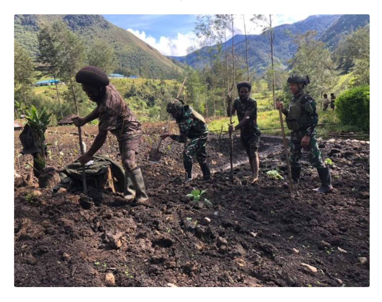
PUNCAK- One of the military units under the command of the Indonesian Armed Forces Operational Command (KOOPS TNI) HABEMA, namely the Task Forces